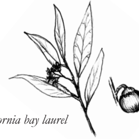
California bay laurel

A LITTLE-USED HIDDEN GEM, the Fern Ravine Trail is well named as it carries you among ferns following the ravine bearing Fern Ravine Creek. The steep, narrow trail starts at a parking lot just off Skyline Blvd. and follows Fern Ravine Creek downhill until merging with the Sunset Trail. Don't miss the old wooden bridge just above the junction with the Sequoia Bayview Trail. No bicycles allowed on this trail.